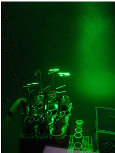
Figure 2. Green LED lights show less backscatter than white lights, improving the pilot’s ability to see ahead. Parallel red lasers on the left are used to provide scale to objects within the field of view.

emitting diode (LED) system—built by Deep Sea Power & Light—was recently tested on the Alvin submersible during engineering dives in June off San Diego. The green lights appear to help pilots when the water is murky with particulate matter; the light does not necessarily penetrate farther, but there is less reflection than with white lights. The LEDs use about one-tenth of the power consumed by traditional Xenon, leaving more battery power for other things.” 5